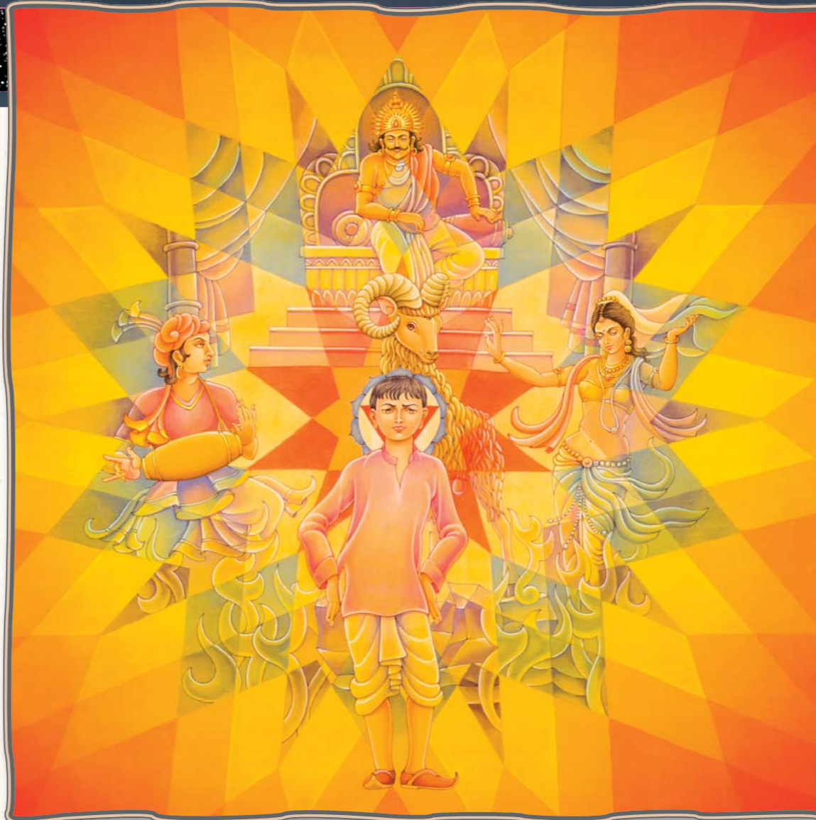
For the young man, awakening of the sensual ego becomes the main problem, as expressed in the fiery nature of the ram. He feels special and wants to be as powerful as a king who owns the city of jewels and entertains himself lavishly. Through selfless service, the king can achieve balance.

A compassionate, three-headed female Deity, Lakini, shows us the beauty of this chakra. After the physical and mental (astral) planes, the plane of thoughts (celestial) is encountered. Instead of exploiting the world, we see that we can use our new-found power to focus the energy of the first two chakras for the benefit of all. We have the power to create heaven on Earth. Here religions take form, which can make living in harmony with nature more practical. Lakini shows that by organizing a society we can raise the spiritual level of the masses. Saints and saint-like persons like to work within this chakra