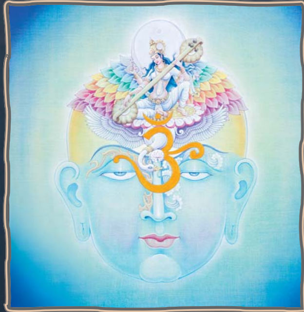
The primary bija-mantra of sahasrara is visarga, a short, abrupt "h" sound indicated in Sanskrit by two dots, one above the other. In the thousand lotus petals one finds all pure sounds. This is the chakra of pure illumination.