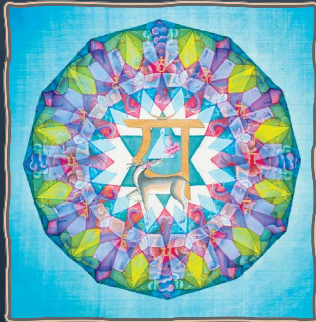
The main bija-mantra of anahata is yaṁ, which vibrates the spiritual heart. The bijas of the twelve petals are kaṁ, khaṁ, gaṁ, ghaṁ, ṇaṁ, chaṁ, chhaṁ, jaṁ, jhaṁ, ñaṁ, ṭaṁ and thaṁ. Here one behaves like a deer or an elephant, for whom touch is all-important. The desire to find security dominates.