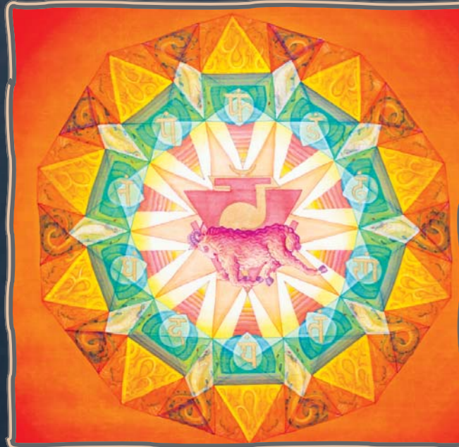
The primary bija-mantra here is ram. It increases the digestive fire, longevity and physical strength, all represented by the ram. The bijas of this chakra's ten petals are dam, dham, nam, tam, tham, dam, dham, nam, pam and pham. Repetition of these helps pacify the mental modifications. Here one behaves like a cobra or a moth, for whom sight is all-important.